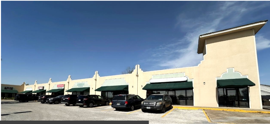
7025-7075 BANDERA RD SAN ANTONIO, TX 78238